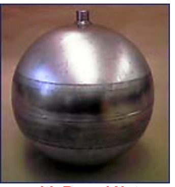
with Round Nut