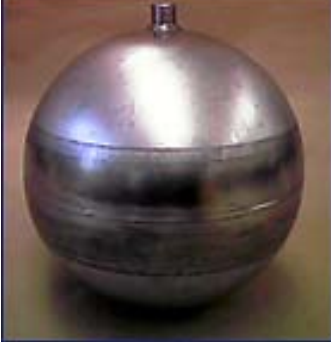
with Round Nut