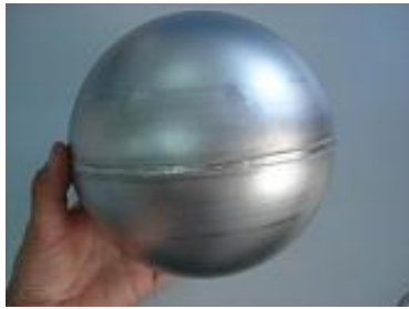
Plain Float Ball