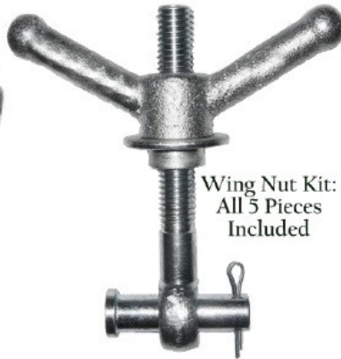
Wing Nut Kit: All 5 Pieces Included